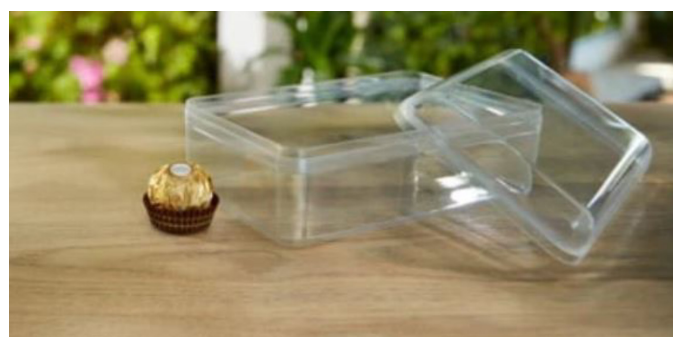
Milliken helps create more sustainable box for Ferrero Rocher.

For more details and information please contact us or visit us online at chemical.milliken.com